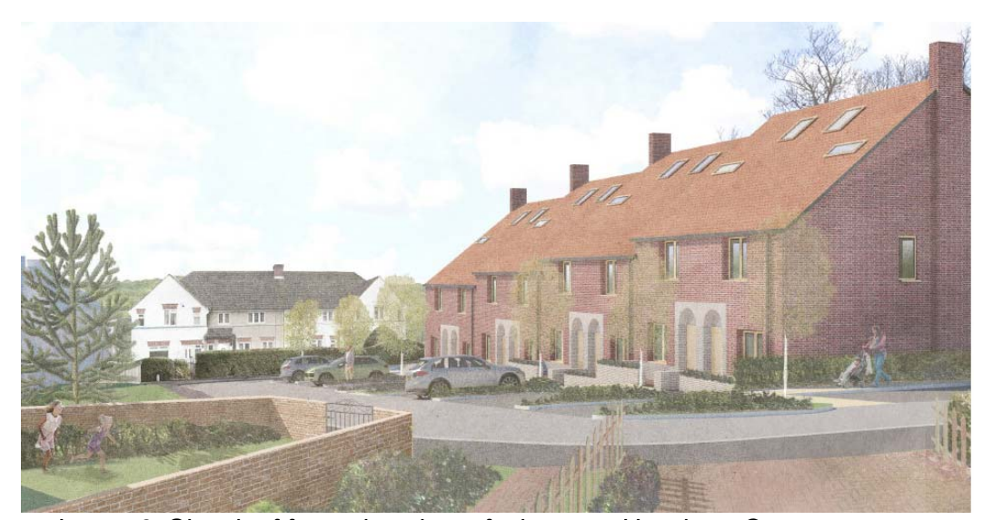
Image 6: Sketch of front elevation - facing onto Hawthorn Crescent