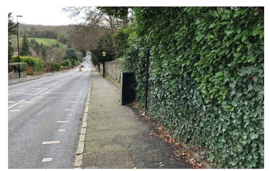
Image 8: View of locally listed flint wall – on opposite side of Old Farleigh Road