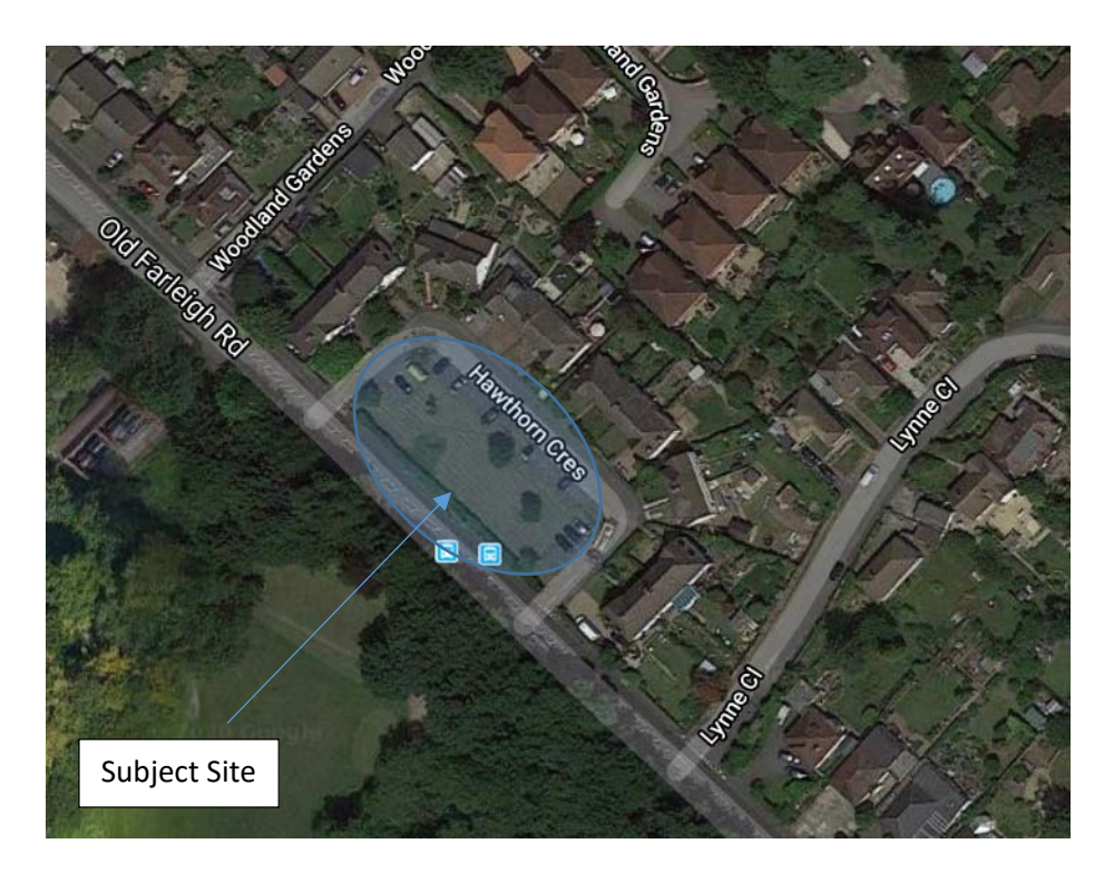
Image 2: Aerial view highlighting the proposed site within the surrounding area