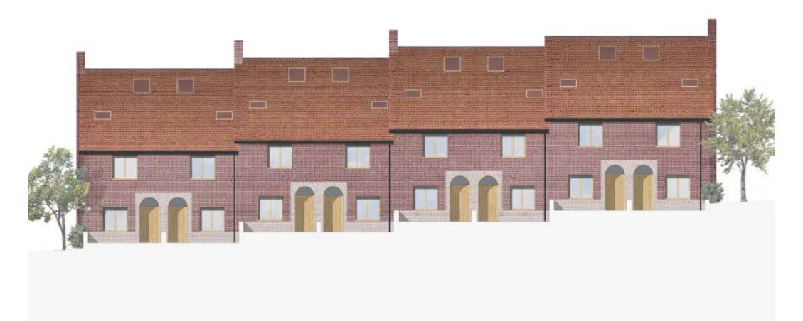
Image 5: Front elevation (two storey mass) facing onto Hawthorn Crescent properties